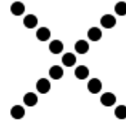
At four minutes