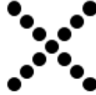
At three minutes