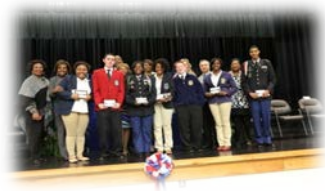
2013 CTAE Students of the Year Bibb County