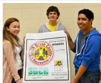
Graphics and Design - Bryan County - 2013