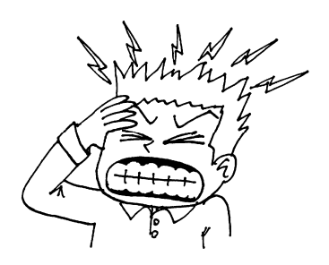
Sample #4 Use the following pictures to describe a patient's symptoms to the emergency room doctor.