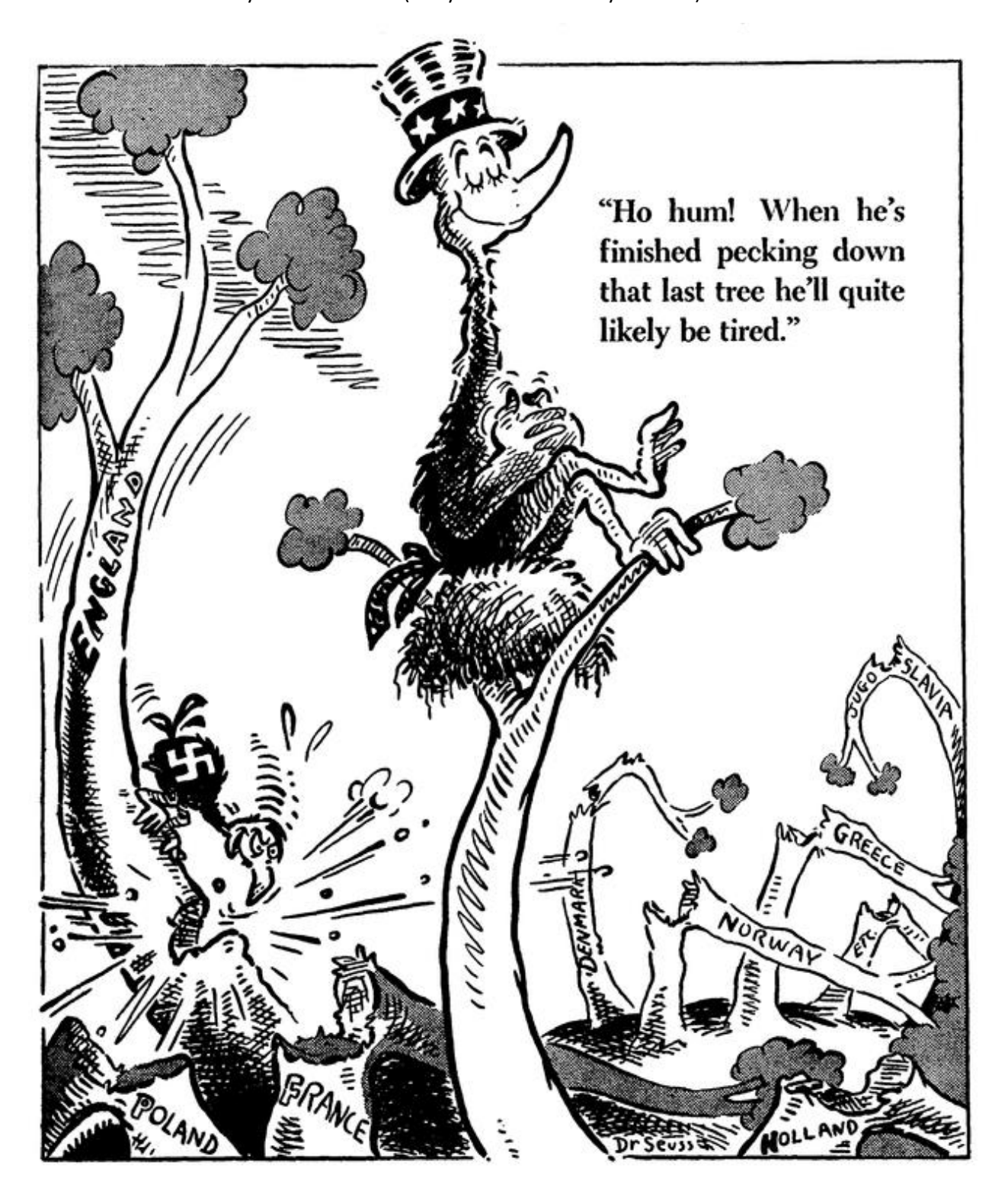
Document 2: Cartoon by Theodor Geisel (use your cartoon analysis sheet)

Allowed under fair use https://library.ucsd.edu/dc/object/bb5461618q/_2.jpg