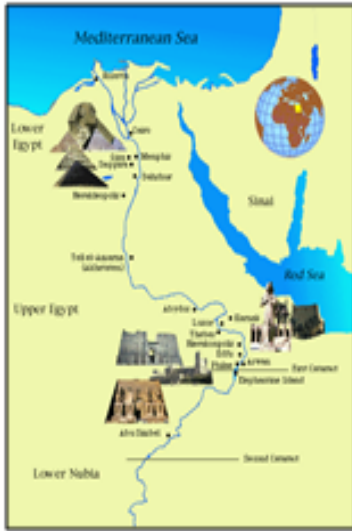
Figure 1: http://www.oocities.org/isis_artemis_0/EgyptMap.htm