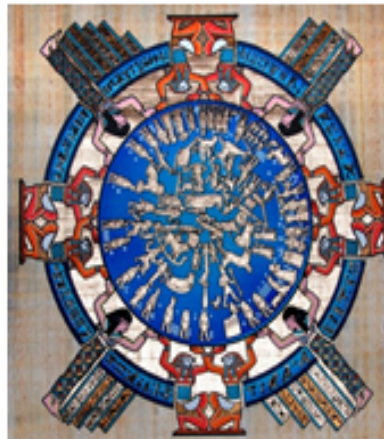
Figure 3: The Egyptian Calendar, https://tsuplus.files.wordpress.com/2012/12/egyptian-calendar-4000bc-2100bc

In order to build large projects including the pyramids and to organize trade, a standard system of weights and measures was necessary. The Book of the Dead, as well as other texts, illustrates the Egyptians weighing objects. The standard unit of measurement was the royal cubit, approximately 52.4 cm. Most