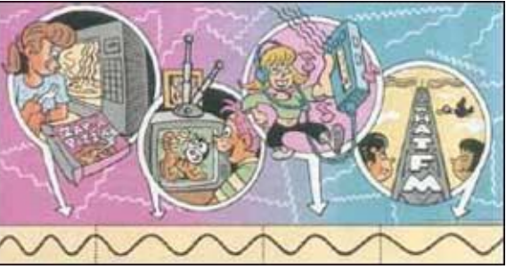
S (COLOR): HELPFUL WAVES