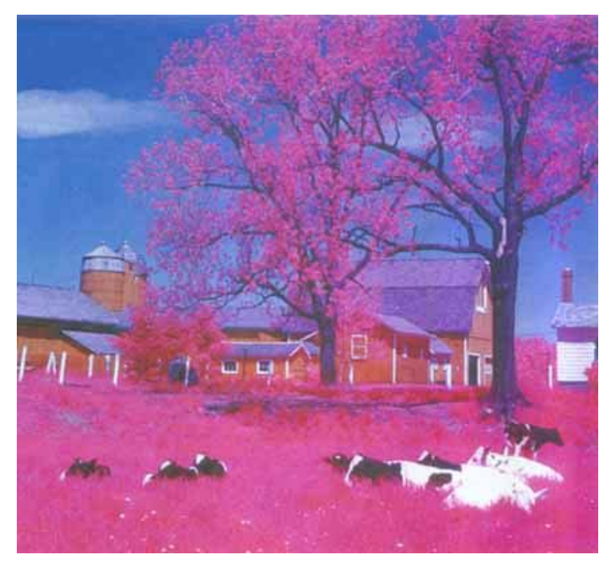
Special film shows reflected infrared waves from grass and leaves as red.