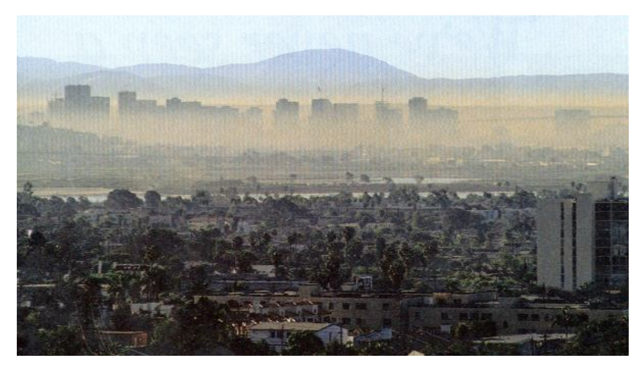
The yellowish-brownish band that obscures this city is photochemical smog, caused in part by the action of sunlight on nitrogen compounds emitted by cars.

Fixed-nitrogen fertilizers are essential if we hope to feed the world's growing population. So far, we have not only kept up but improved. The calories available per person per day in developing countries rose from 2,140 between 1969 and 1971, when the world's population was 3.7 billion, to 2,520 between 1990 and 1992, when the population had grown to 5.3 billion. This success would not have been possible without the nitrogen.