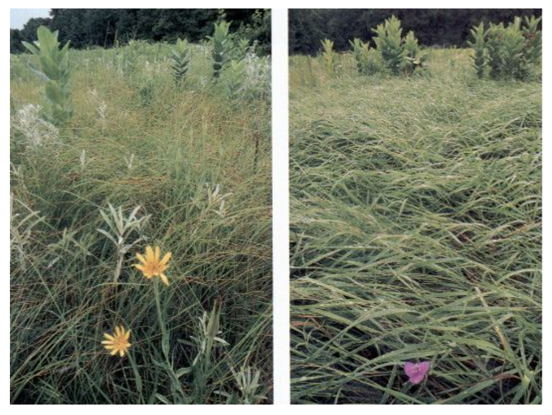
The test patch at left received some nitrogen and has a dozenplant species. Lots of nitrogen was added to the plot at right, leaving only quack grass.

Most experts agree that the farm, and specifically the more efficient use of fertilizer there, is the place to start looking for ways to decrease our nitrogen use. On some farms, fertilizer is applied long before plants can use it, so that most of what the farmer buys and puts on the field is gone before it's actually needed. Vitousek used the term "precision agriculture" to describe techniques now being developed to cut nitrogen use without cutting productivity. It might, for example, be better to apply nitrogen more often but in smaller, carefully timed doses than to dump it on a field all at once.