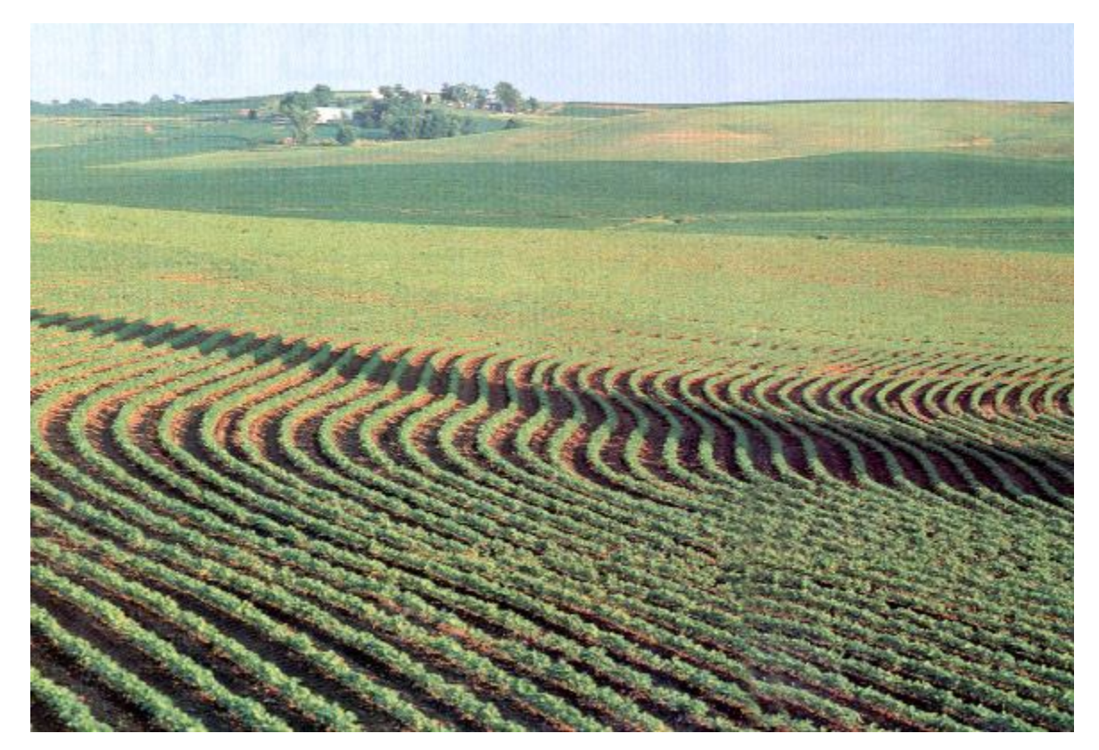
Rows of soybeans, which add nitrogen to the soil, flank aswath of corn on this Iowa farm. The crops' places are switched yearly.

Farmers have known for millennia that the way to rejuvenate worn-out fields is to plant legumes, thereby returning nitrogen to the soil. Plowing the plants under at the end of the season adds to the restoration. Today leguminous crops add about 40 million tons of fixed nitrogen to the global ecosystem each year.