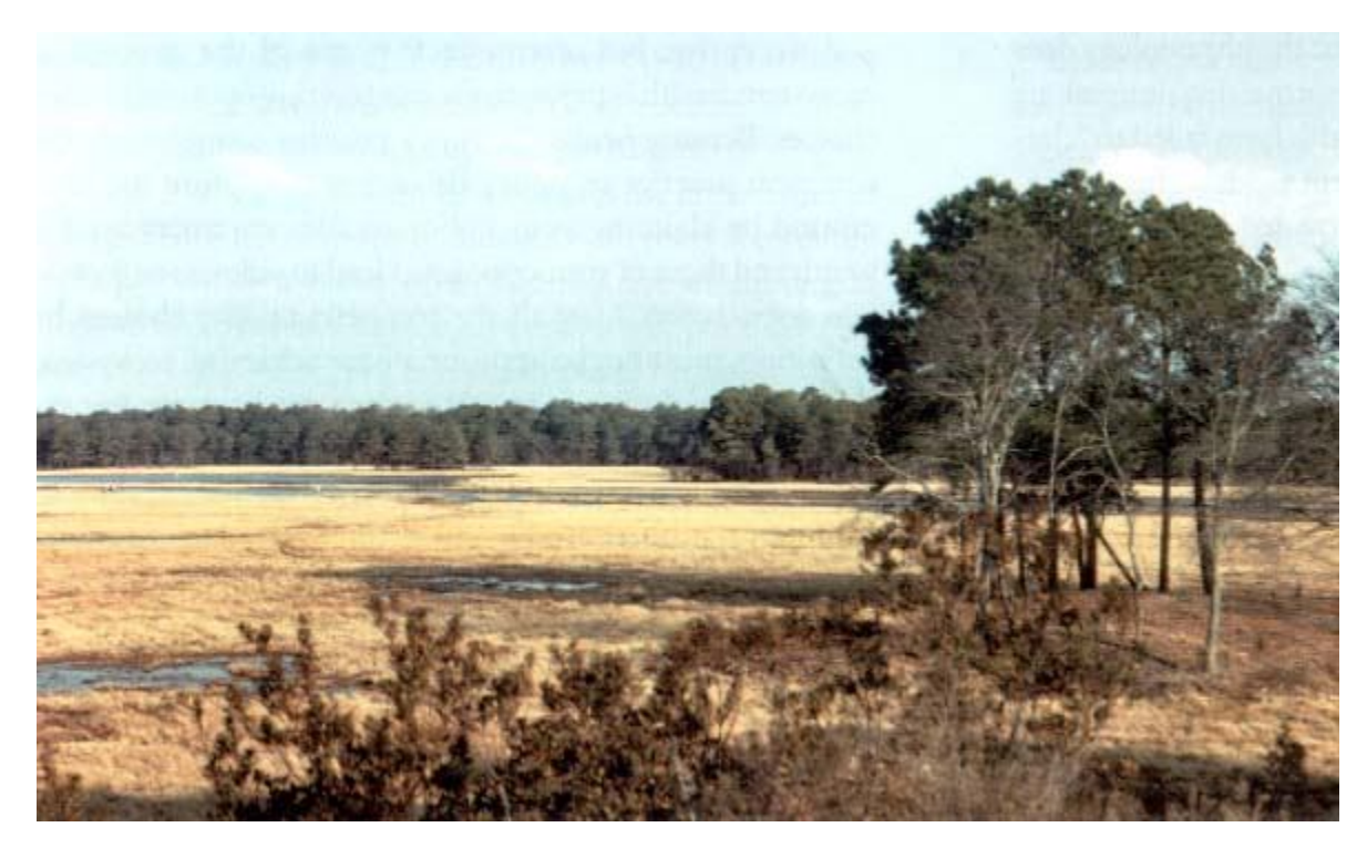
Figure 3. A natural misunderstanding. Although rarely stated explicitly, there is often an underlying premise that natural systems are inherently healthier than human-altered systems and are, therefore, preferable as a policy choice.

If a notion of ecosystem health is to be used in implementing ecological policy, then coherent, clear, quantifiable definitions should be used (Ulanowicz 1997). Currently there are many, often contradictory, definitions of ecosystem health, so consensus on the exact meaning is essential to focusing policy debate on societal tradeoffs, not semantic niceties.