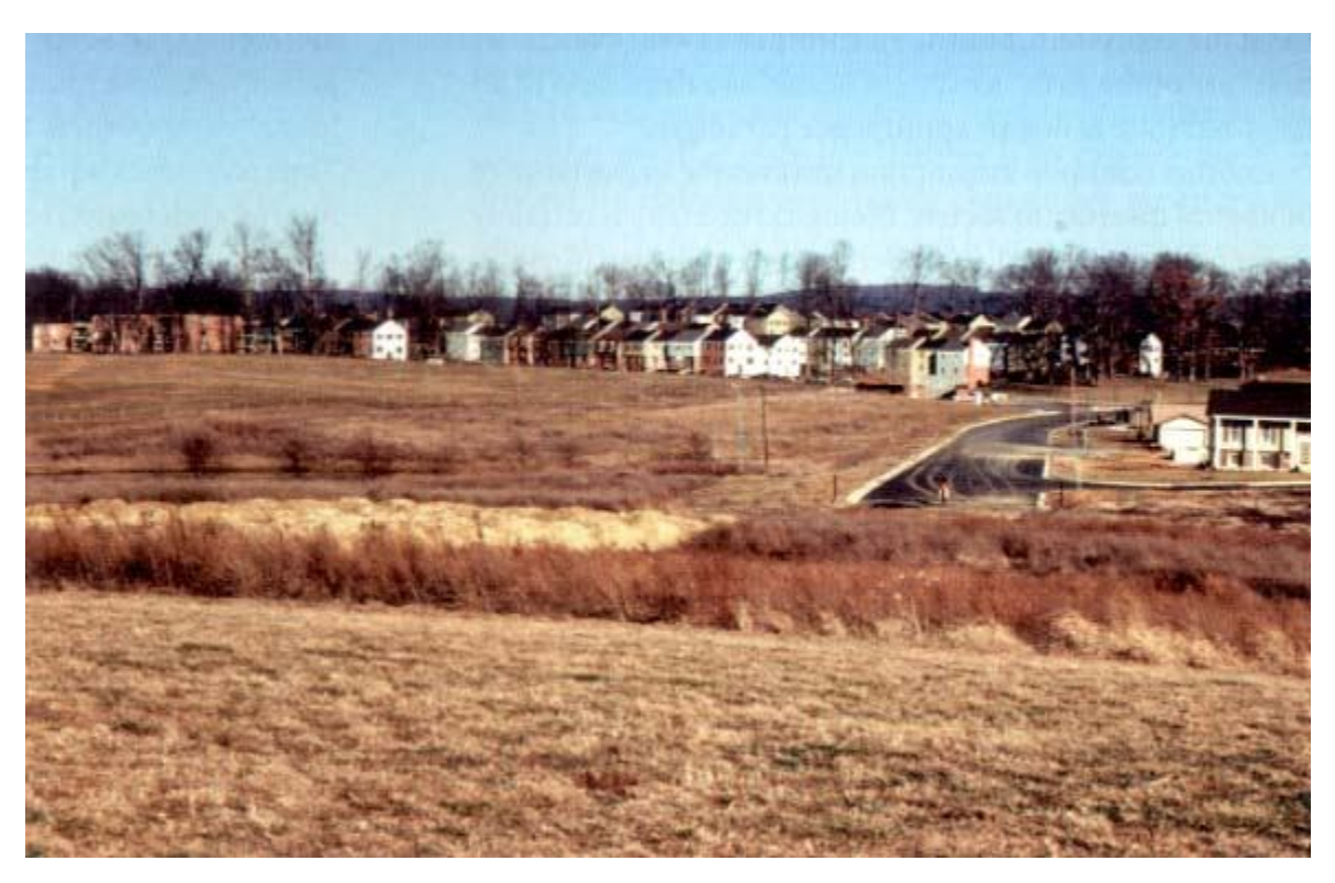
Figure 2. Defining ecosystem health. Most notions of ecosystem health concern all types of landscape-level ecosystems, not merely those unaltered or minimally altered by human actions.