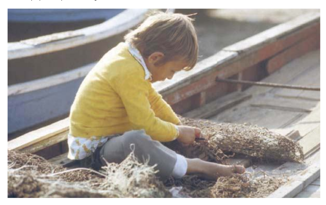
Child repairing a net

Portuguese wines (vinhos) are world famous and are enjoyed with meals. Strong coffee is also popular, particularly with dessert.