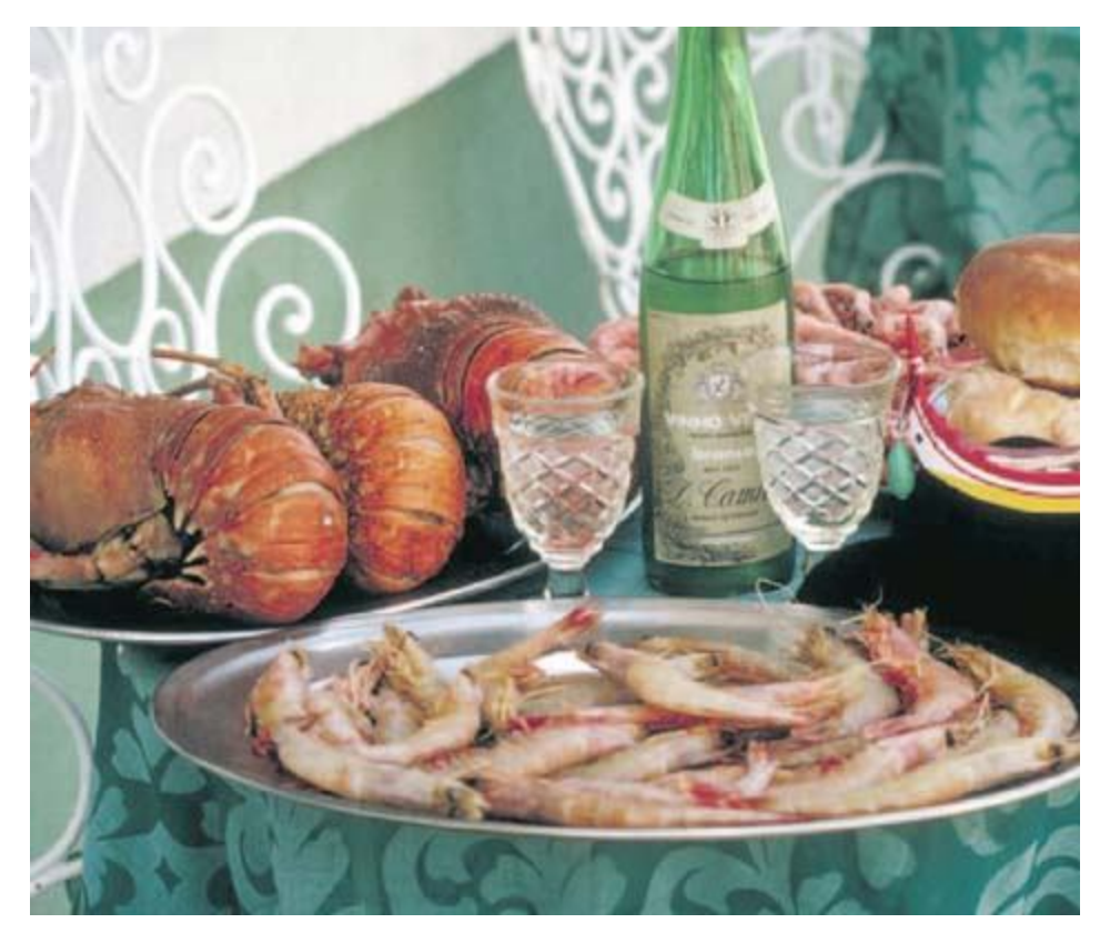
Typical Portuguese fare

Portugal boasts several modern-day writers who have achieved fame. Modern literature includes several poets, including Frenando Pessoa, who wrote during the early 1900s, and writer José Saramago, who won the Nobel Prize for literature in 1998.