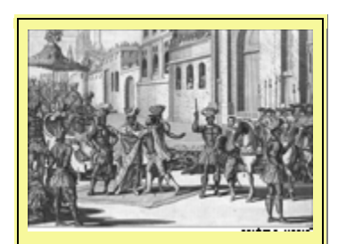
Cortes Meets Montezuma

Cortes entered the city and went to Montezuma's palace. He threatened to take Montezuma prisoner unless the Aztec leader turned the empire over to him. Montezuma agreed.