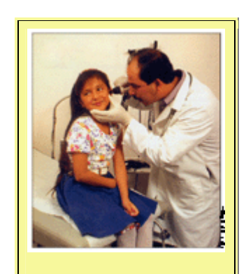
Doctor Examining Young Girl

An important part of public health is community health , which deals directly with the people in one area. People who work in community health include the clinic nurse who gives you a flu vaccination and the inspector who makes sure the burger in your local restaurant is safe to eat.